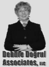
Debbie Doğrul Associates, LLC

Call Debbie Doğrul Associates today at 703-425-3582 and get moving!